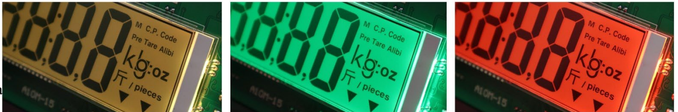
Adjustable Tri-Color Check Result Backlight